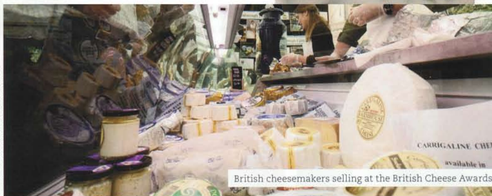
British cheesemakers selling at the British Cheese Awards

more than 500 entries, a record for the annual competition. This year's event crowned Barkham Blue, made by Two Hoots Cheese as Supreme Champion. Other winners included Montgomery's Traditional Cheddar (available in the US at select specialty cheese counters); Red Leicester Aged from Long Clawson Dairy; Farleigh Wallop No. 2 from Evenlode Partnership; and the wonderfully named Stinking Bishop from Charles Martell & Son. Get more information at www.thecheeseweb.com .