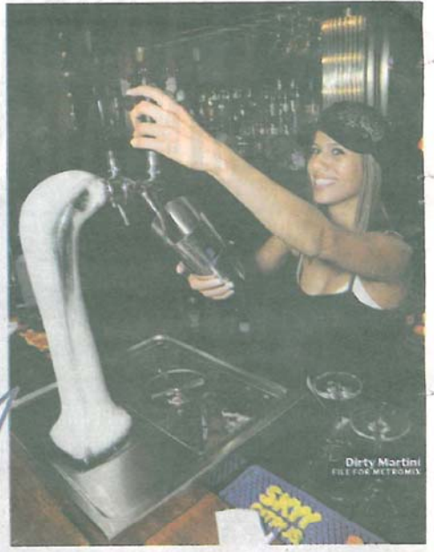
Dirty Martini FILE FOR METROMIX

Best alfresco scenes The sizzling singles scene at ZED451's rooftop bar had revelers lining up to get in, while Old Oak Tap's expansive beer garden is the perfect place to laze with a pint in hand.