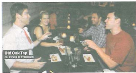
Old Oak Tap FILE FOR METROMIX

Best alfresco scenes The sizzling singles scene at ZED451's rooftop bar had revelers lining up to get in, while Old Oak Tap's expansive beer garden is the perfect place to laze with a pint in hand.